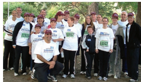
A few of the 300 participants in the MM5K Walk/Run.

our most successful event to date. We could never have done this without the enthusiasm, dedication and ongoing support of each every one of our committed fundraisers, donors, corporate sponsors, patients, families, friends, volunteers and the PMH medical/support staff.